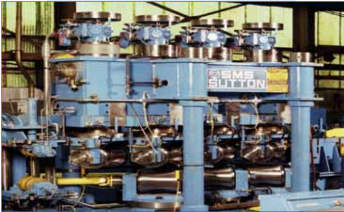
Quick Opening Rolls

By opening or lifting the individual or cluster rolls when the product enters or leaves the straightener, you can eliminate end damage to the product. Quick opening or quick lift devices also improve quality and simplify straightening of upset pipe.