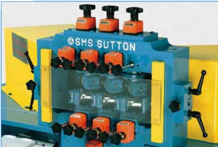
Digital Roll Position Indicators

Not only do they eliminate those problems they also simplify the adjustment. They allow you to document the precise adjustment for a certain product and easily repeat that exact set-up the next time you run that product. Digital Roll Position Indicators can be used with manual and with powered systems. In combination with a PLC the adjustment can even be completely automated.