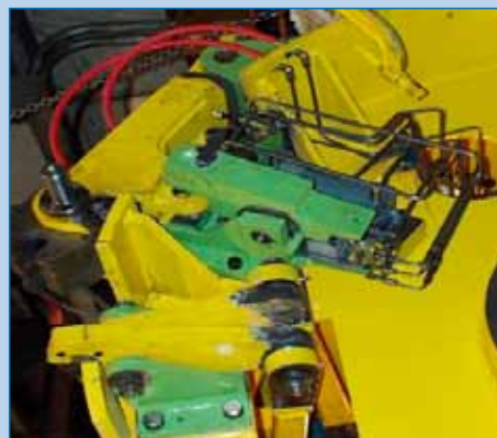
A view of the top of a new 84" IV Drawblock drum showing the new Gripper Arm Latch mechanism and the new Tube Shear and arms